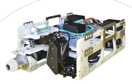
COUGAR-XTI DETACHABLE TORQUE SKID